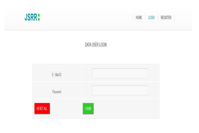
Fig 4.Data User Login